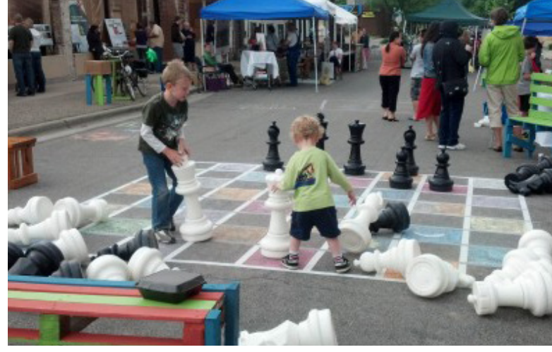
Art on and in the Street