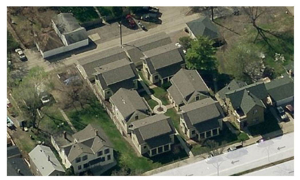
Cottage Court at 8th and Main